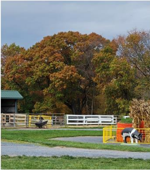
Black Oak – Frederick