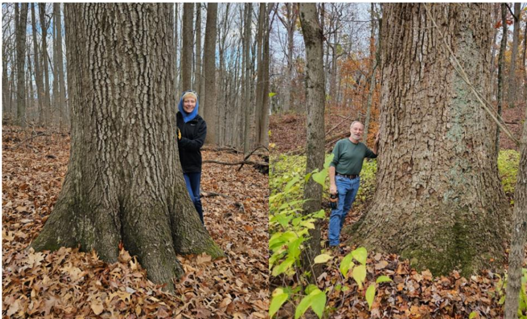
Scarlet Oak - Oregon Ridge