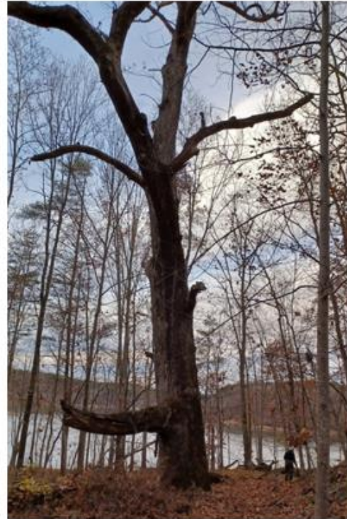
White Oak - Carroll