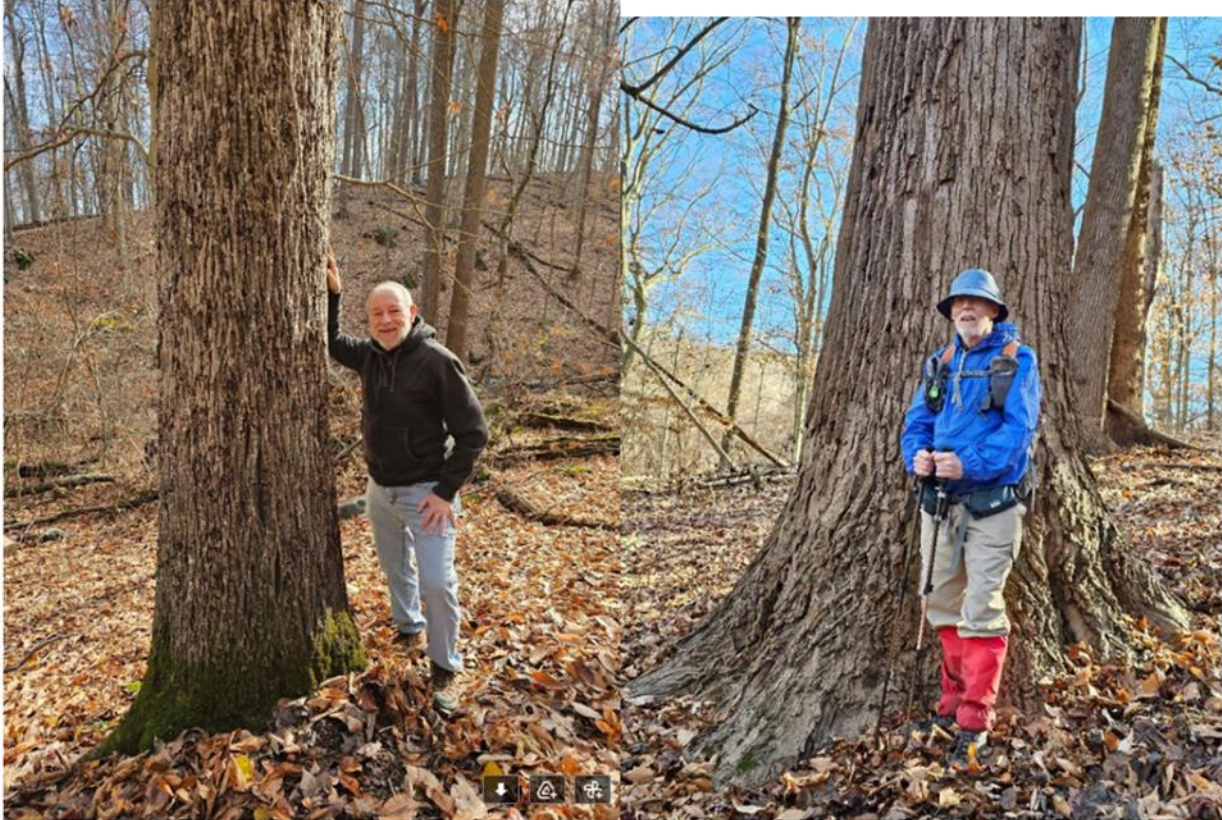
Pignut Hickory - Orange Grove, PVSP