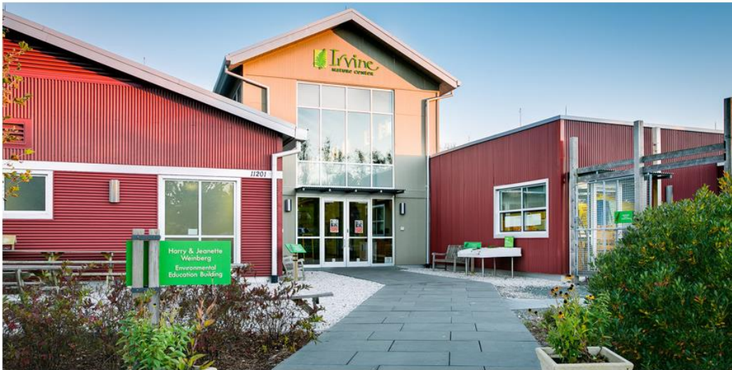
Figure 2. A photo of the Irvine Nature Center referenced in the report.