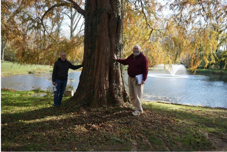
Scarlet oak, Baltimore County Champion