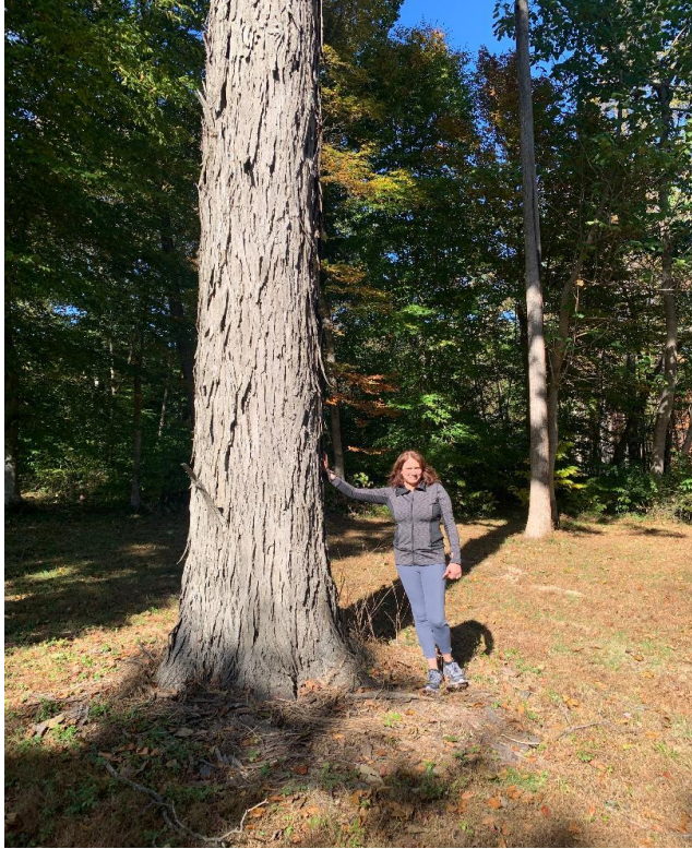
Shagbark Hickory, Talbot County Champion